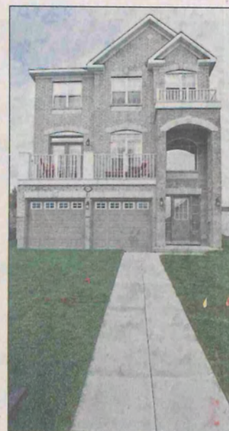
Phoenix's Columbia is built into a hillside, so you enter at the 'basement' level, with the main living quarters on the first floor.