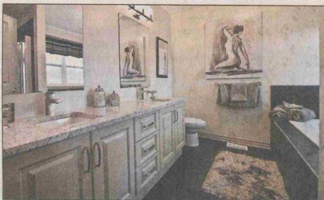
The master ensuite has a separate shower and Roman tub.

The main living space of the home is on the next level. Walk up the stairs to the main level and straight ahead is a large laundry room with a deep washing sink. While it may not be the first thing you